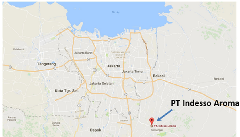
Figure 1: Project location

The expected emission reduction that would be achieved by the proposed project is 4,059 tonnes CO 2 until end of March 2028. The actual emission reduction may vary depending on the actual operation of the power plant and the sun radiation in the area throughout the year.